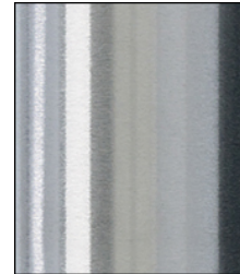
SAT Satin Finish