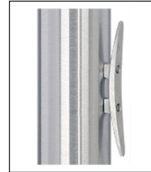
CLA-9090-SAT | 7' from bottom Cleat Only